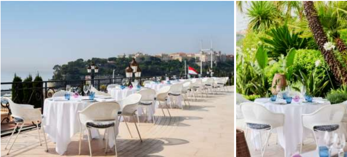
Em Sherif Monte-Carlo