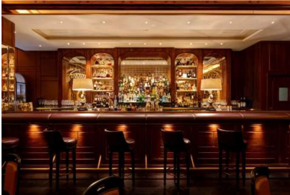
Le Bar Américain of Hôtel de Paris Monte-Carlo

The legendary Bar Américain unveiled its new look in summer 2018. With new interiors created by David Collins Studio, the design elegantly combines the bar's traditional features with new elements that revive its personality. The walls are lined with amber and burgundy-coloured silk, subtly framed by rosewood, with new leather furniture in tones to match the walls creating an immediately welcoming environment. A marble floor mosaic and deep-pile rugs create a cosy and calming atmosphere, providing a glamorous daytime and night-time setting, thanks to soft, warm lighting.