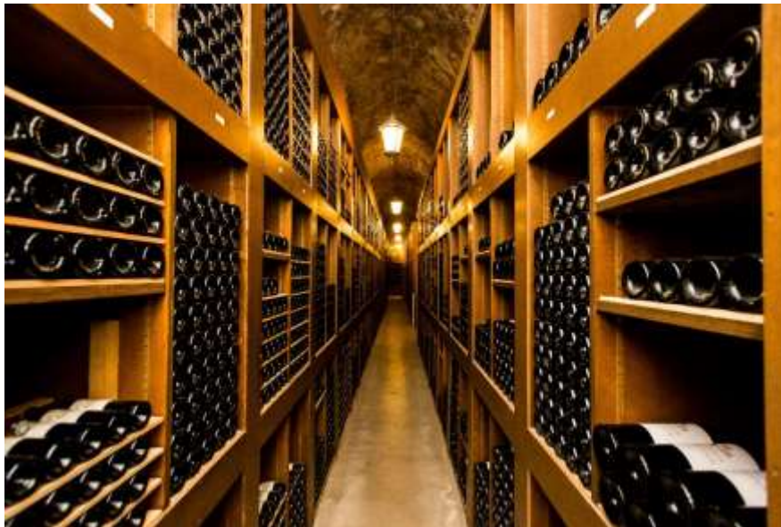
Cave de l'Hôtel de Paris Monte-Carlo

Hôtel de Paris Monte-Carlo also owes its reputation to its cellars, which were built behind the palace in 1874 based on the model of a Bordeaux winery. These cellars supply every establishment of the Monte-Carlo Société des Bains de Mer resort. Today, the cellars of Hôtel de Paris Monte-Carlo are exceptional thanks to their large 1,500 sq.m. surface area with over 350,000 bottles stored in over 1.5 kilometres of racks and 3,700 wine references. It is undoubtedly the biggest hotel and restaurant cellar in the world, showcasing rare wines and famous liqueurs in optimal storage conditions. Much older, ancient vintages cannot be sold and instead are stored in the Réserve Marie-Blanc, which was built on site in 1990. Guests can experience a one-of-a-kind dining experience in Hôtel de Paris Monte-Carlo's cellars in a reception room for up to 40 people. Available on request only, this wonderful opportunity was popular also with H.S.H Prince Rainier and H.S.H Princess Grace, as they celebrated their 20 th wedding anniversary here in 1976.