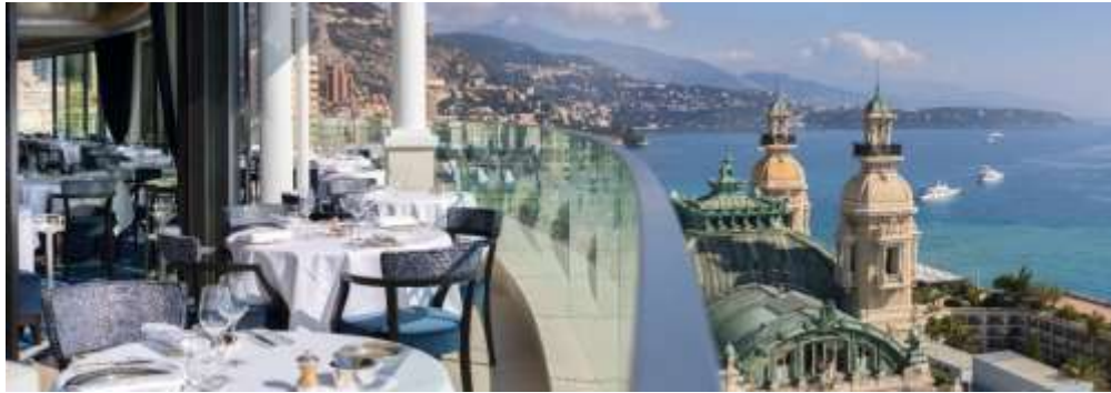
Le Grill restaurant on the 8 th floor of Hôtel de Paris Monte-Carlo

One of the most elegant and lively venues in the Principality of Monaco, Le Grill is on the 8 th floor of Hôtel de Paris Monte-Carlo. With breath-taking views of the Mediterranean and the Principality, the restaurant features marine-inspired décor, high-quality cuisine and a roof that can disappear to offer guests the magical experience of dining under the stars.