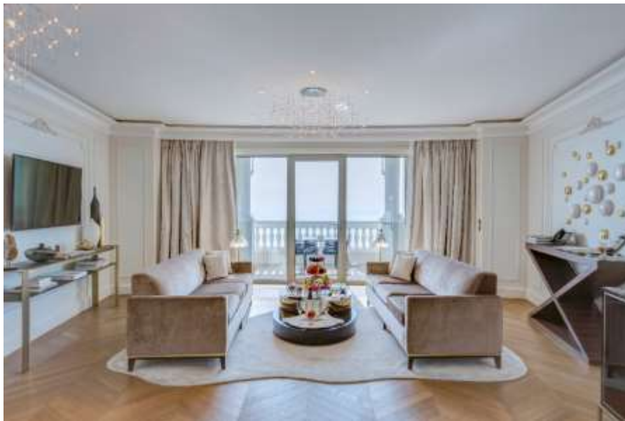
Diamond Suite at Hôtel de Paris Monte-Carlo

The classically decorated room offer a more colourful atmosphere. The furniture is timeless, paired with Louis XVI style pieces for a touch of classicism. Bronze fabrics add a shimmer in the bedrooms and lounges while antique mirror, brass in the mini bars, velvet additions and decorative cushions in precious fabrics add refinement and additional comfort. The luxurious, soft and smooth materials create a room full of light and contrasts, delicately designed with the guest in mind.