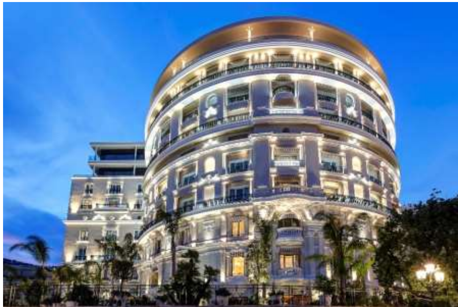
The Rotunda of Hôtel de Paris Monte-Carlo