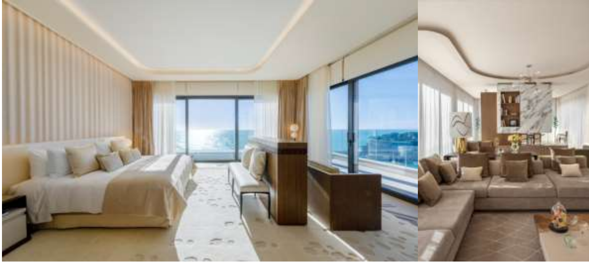
Suite Princesse Grace

The Princess Grace Suite is the most exclusive and exceptional setting on the Riviera to date. Inspired by the timeless elegance and delicate refinement of Princess Grace of Monaco, this 910 sq.m. Suite is spread over two floors (7 th and 8 th ), including 440 sq.m. of outdoor space – offering a rare, ultra-private experience like no other.