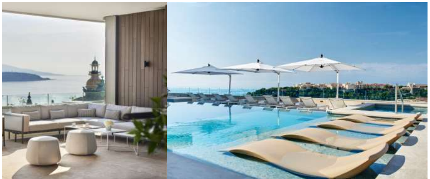
Wellness Sky Club

A rooftop Wellness space “Wellness Sky Club” opened exclusively for guests of the hotel, with 370 sq.m. of indoor spaces and 490 sq.m. of outdoor spaces, a terrace, swimming pool and loungers, steam room, sauna, fitness room and bar/lounge area. The new space complements the Thermes Marins Monte-Carlo offer, accessible directly from the hotel.