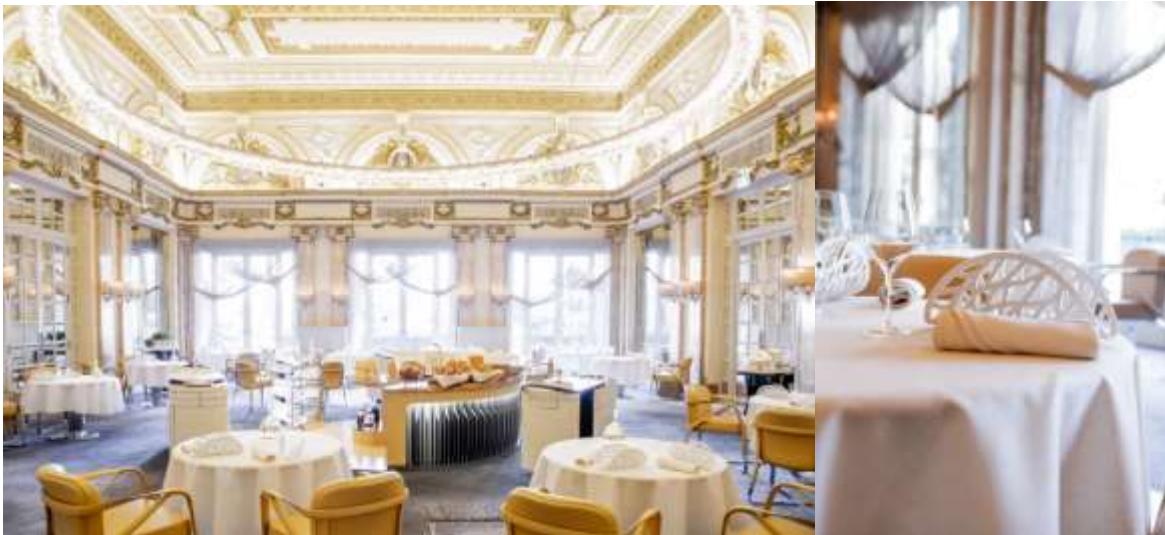
Le Louis XV – Alain Ducasse Hôtel de Paris