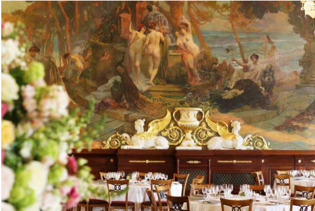
Salle Empire - Hôtel de Paris Monte-Carlo

For the 2018 festive season, the Salle Empire has also been given a fresh look with a restoration of its paintwork and gilding, and cleaning of its legendary frescoes. A new carpet has replaced the old but has retained its original pattern, the technical equipment has been modernised and the back of house areas have been redeveloped. Still used as the destination for the most wonderful evening events of the Principality, the listed Salle Empire is the perfect setting for private dinners which can host to 350 guests, as well as concerts and shows for a carefully selected audience. This one-of-a-kind venue in Monte-Carlo has played host to some of the world's most spectacular and prestigious parties including weddings, ceremony, international meetings, numerous charity galas and memorable celebrations.