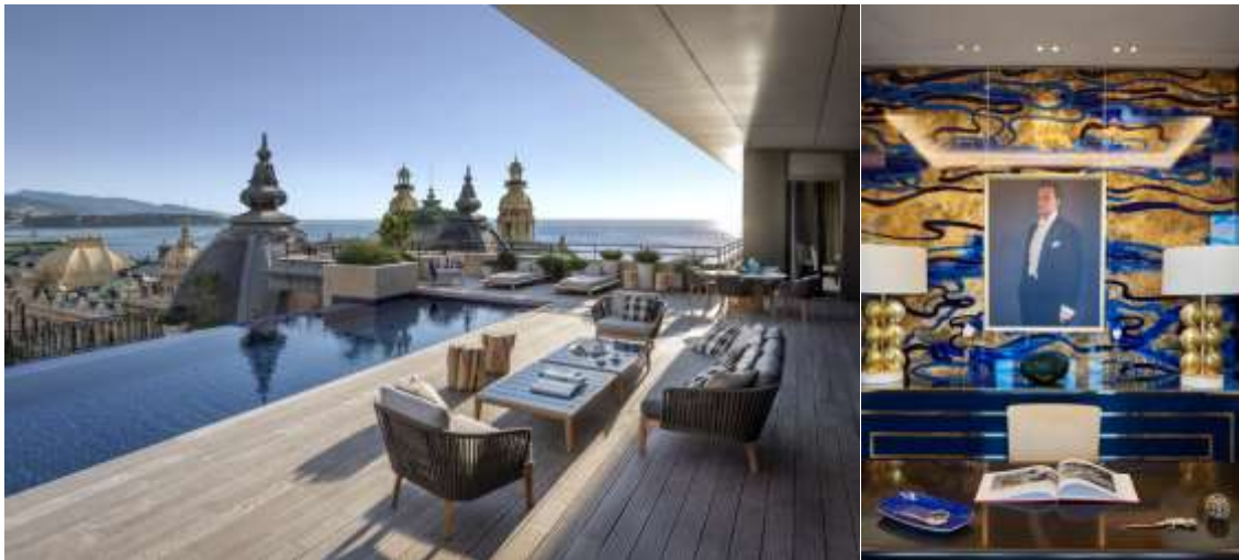
Suite Prince Rainier III

In February 2019, Hôtel de Paris Monte-Carlo has announced a new addition with the opening of a second exclusive 525 sq.m. suite, the Prince Rainier III Suite . The largest suite in Hôtel de Paris Monte-Carlo, it has more indoor space than any other room with two bedrooms and the possibility to extend to 600 sq.m. with a third adjoining room - all of which overlooks Place du Casino. Guests can experience their own steam shower and sauna, private bar in the lounge, an office space and a superb 135 sq.m. terrace with an infinity pool with wave system.