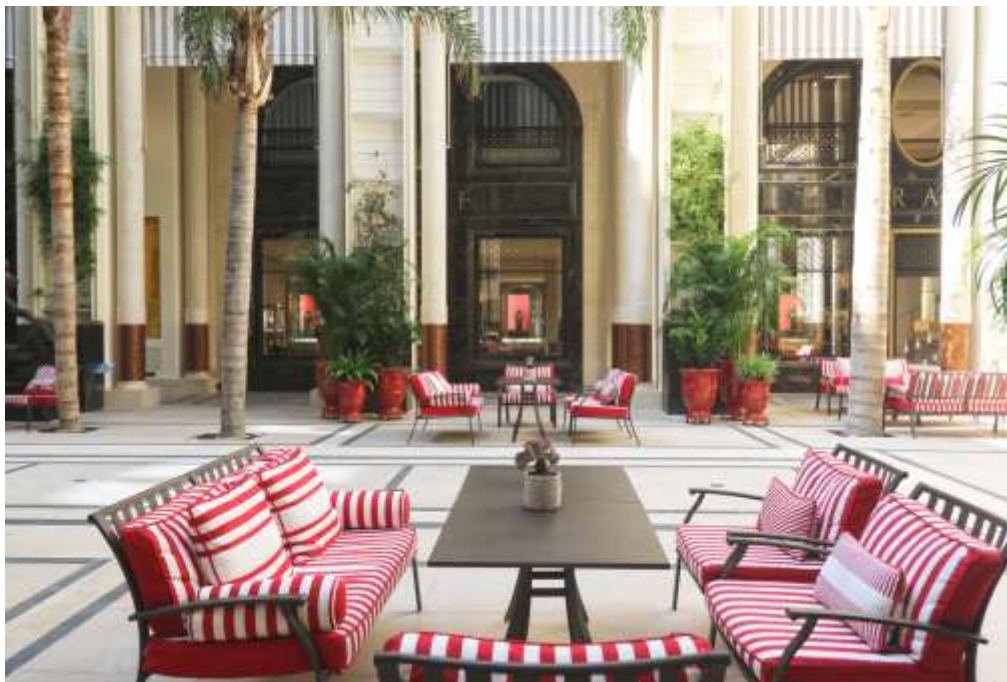
Patio of Hôtel de Paris Monte-Carlo

The new tree-lined Le Patio offers an ultra-exclusive setting for leading fine jewellery houses from December 2018, such as Graff, Harry Winston, Stardust Monte-Carlo and Omega. Le Patio offer direct access to the Avenue des Beaux-Arts, opening onto the new One Monte-Carlo shopping area and its beautiful promenade. Surrounded by a covered walkway, with mosaic flooring using motifs found in the Lobby's central cupola, and the marble-clad façades using the distinctive dark black Saint Laurent marble with strands of red and yellow, the central Patio area will be cobbled and decorated with palm trees and Mediterranean trees - creating a calming green space at the heart of the hotel.