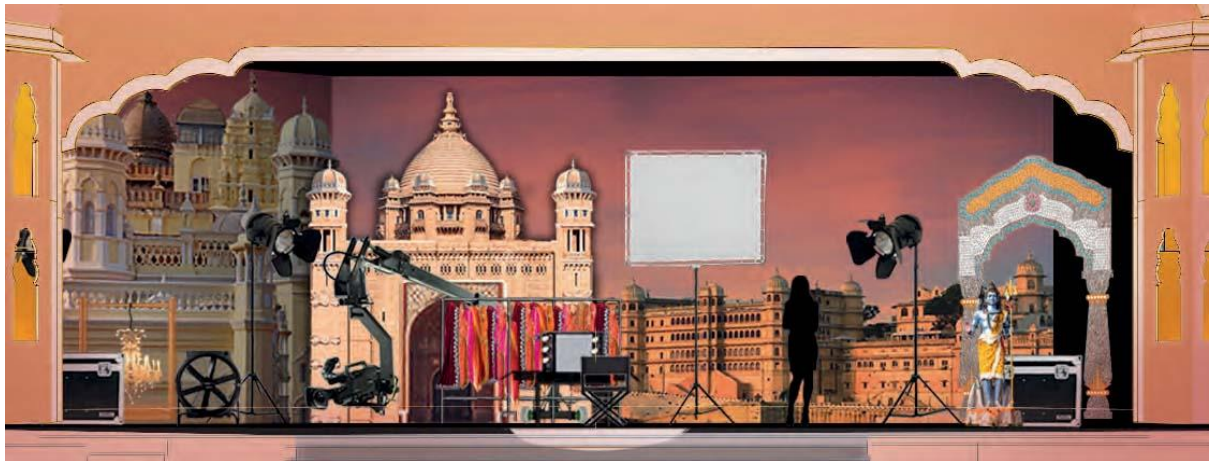
The stage décor