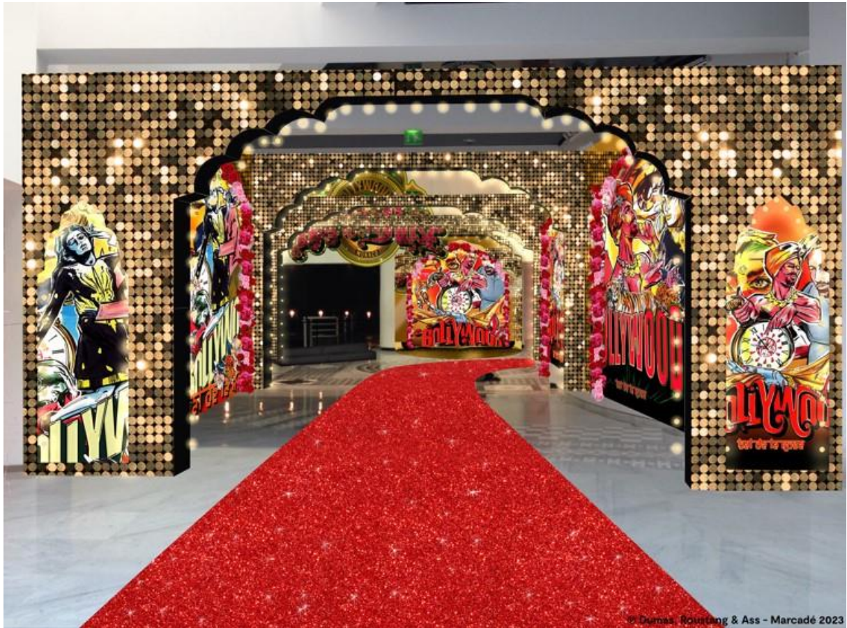
The entrance décor