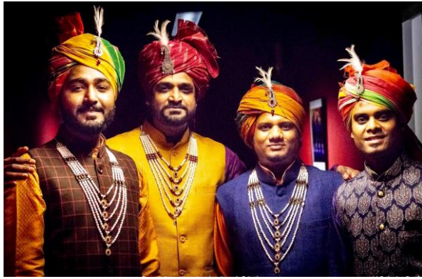
The group Bassant