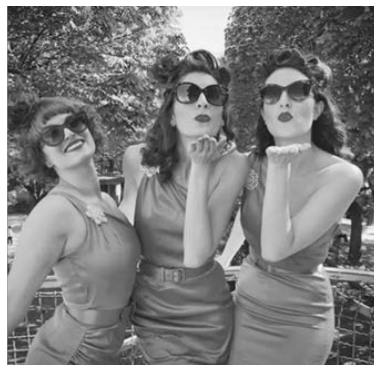
Les Bouches Rouges