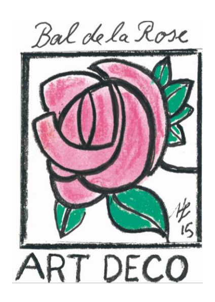
Designed by Karl Lagerfeld

Under the Presidency of H.S.H. Prince and Princess of Monaco and H.R.H. Princess of Hanover