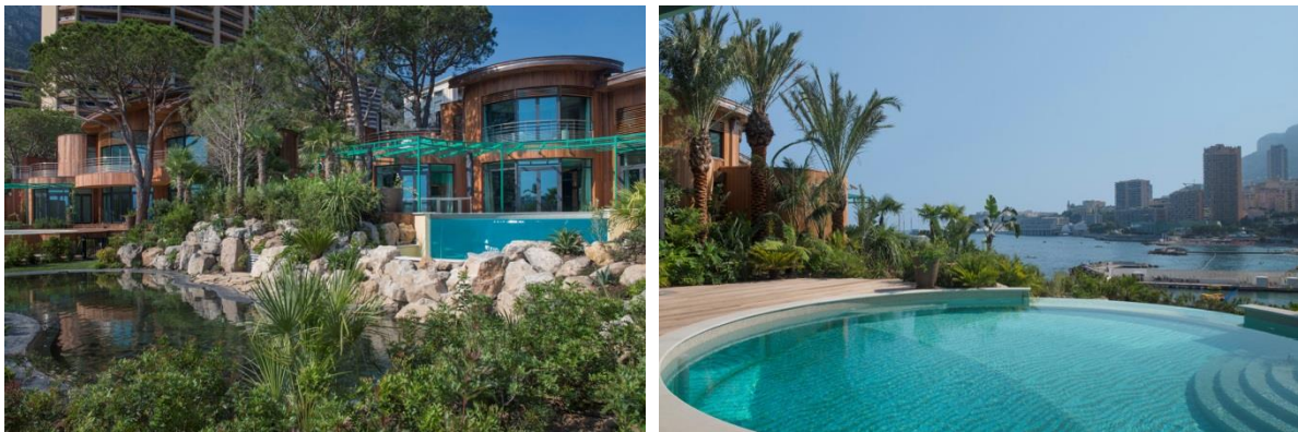
© Monte-Carlo Société des Bains de Mer/ Jean-Jacques L'Héritier

The goal of this Monte-Carlo Société des Bains de Mer project was to obtain a discreet finished product, fully integrated in this natural haven. A challenge that was perfectly met by the architects.