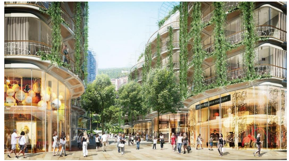
The new Promenade Princesse Charlène