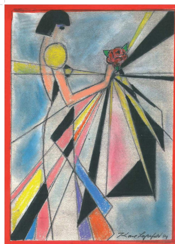
Le Bal de la Rose Constructiviste