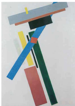
Kasimir Malevitch la modernité en marche

Constructivism is an artistic, architectural and spiritual movement that emerged in Russia in the early 20th century (1917-1921). It revolutionized the art world, proclaiming minimal abstraction but also geometrical space construction of mainly using coloured elements such as the circle, rectangle and straight line.