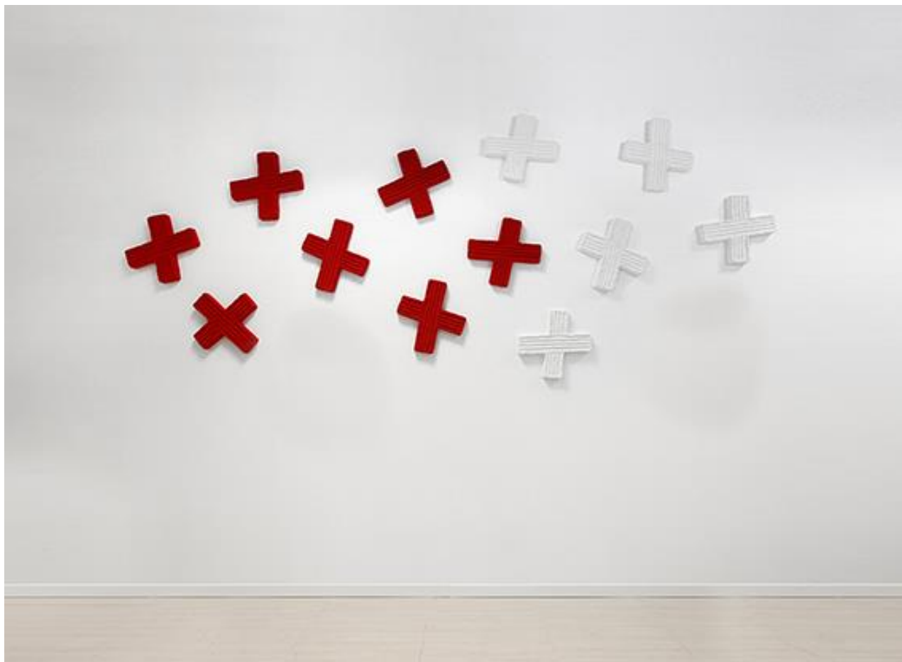
Pino Pinelli, Pittura R. B. 2016. Mixed media, dissemination of 12 elements 36 x 39 cm (each)